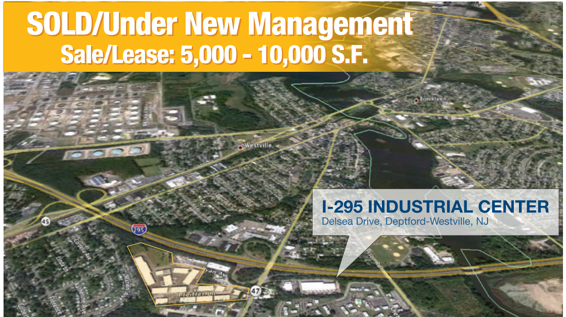
I-295 INDUSTRIAL CENTER Delsea Drive, Deptford-Westville, NJ

SOLD/Under New Management Sale/Lease: 5,000 - 10,000 S.F.